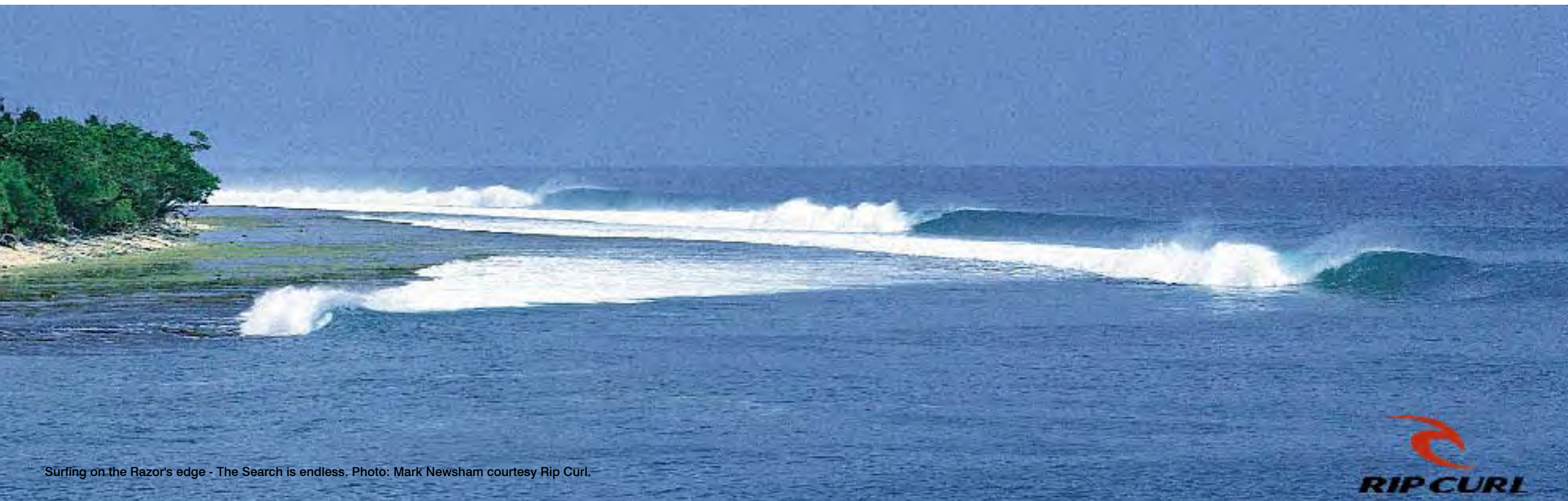
Surfing on the Razor's edge - The Search is endless.