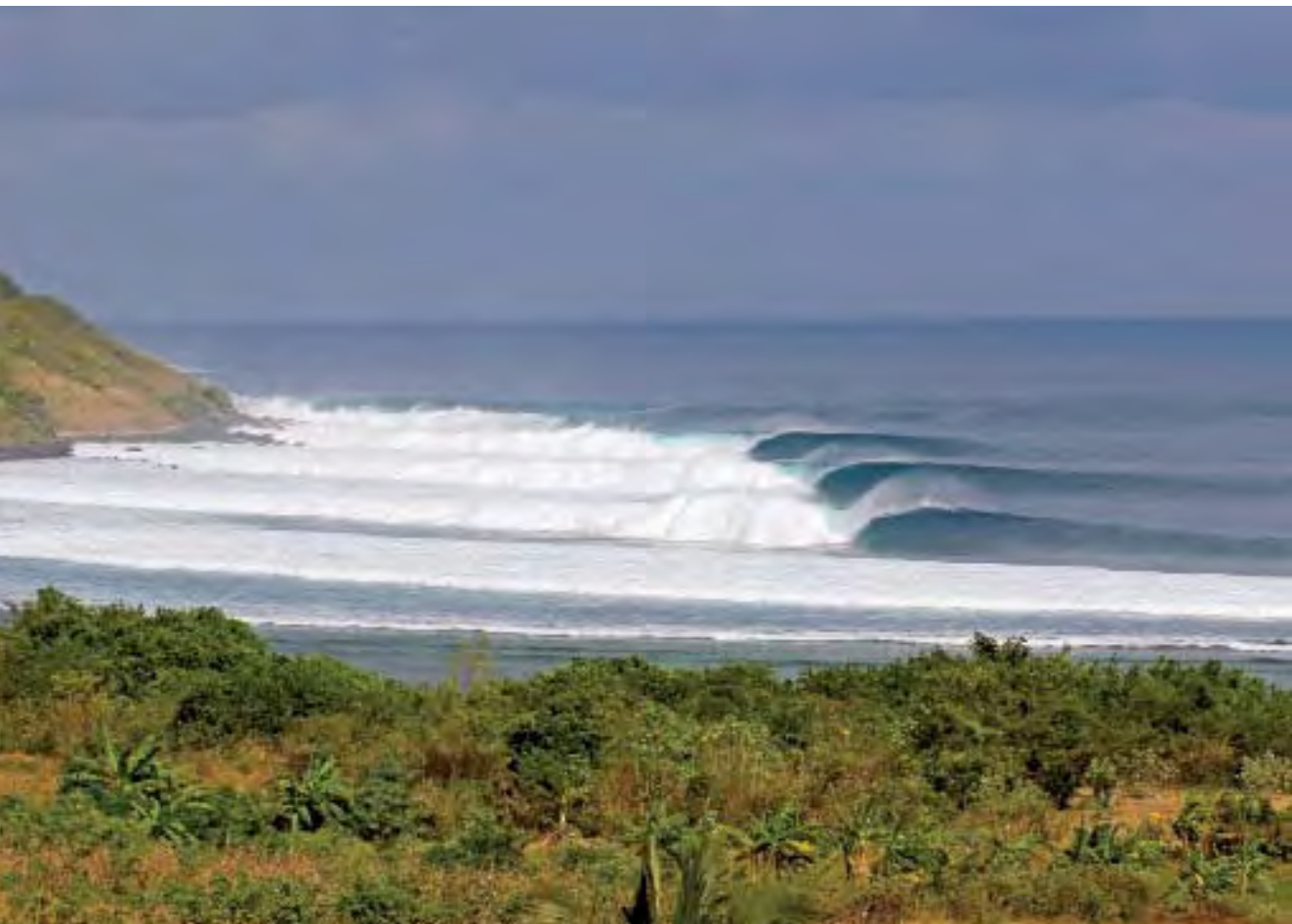
New Discovery, not yet surfed because nearby waves are better and less deadly. "Melon Busters"

For the last 20 years this guidebook has helped thousands of surfers explore the magical islands of Bali, Java, Sumatra, Mentawai, Lombok, Sumbawa, Sumba, Timor, Rote and the 17,000 other uniquely special Indonesian "Spice Islands".