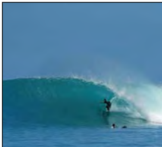
Saraina Koat Mentawai

One tip to remember is that most Bali waves get better in the afternoons, after the trade wind has straightened the swell out, so sometimes the early mornings aren't too crowded. The sun comes up around 6:30 am. The surf doesn't get too crowded until 9 am after most tourists finish their buffet breakfast.