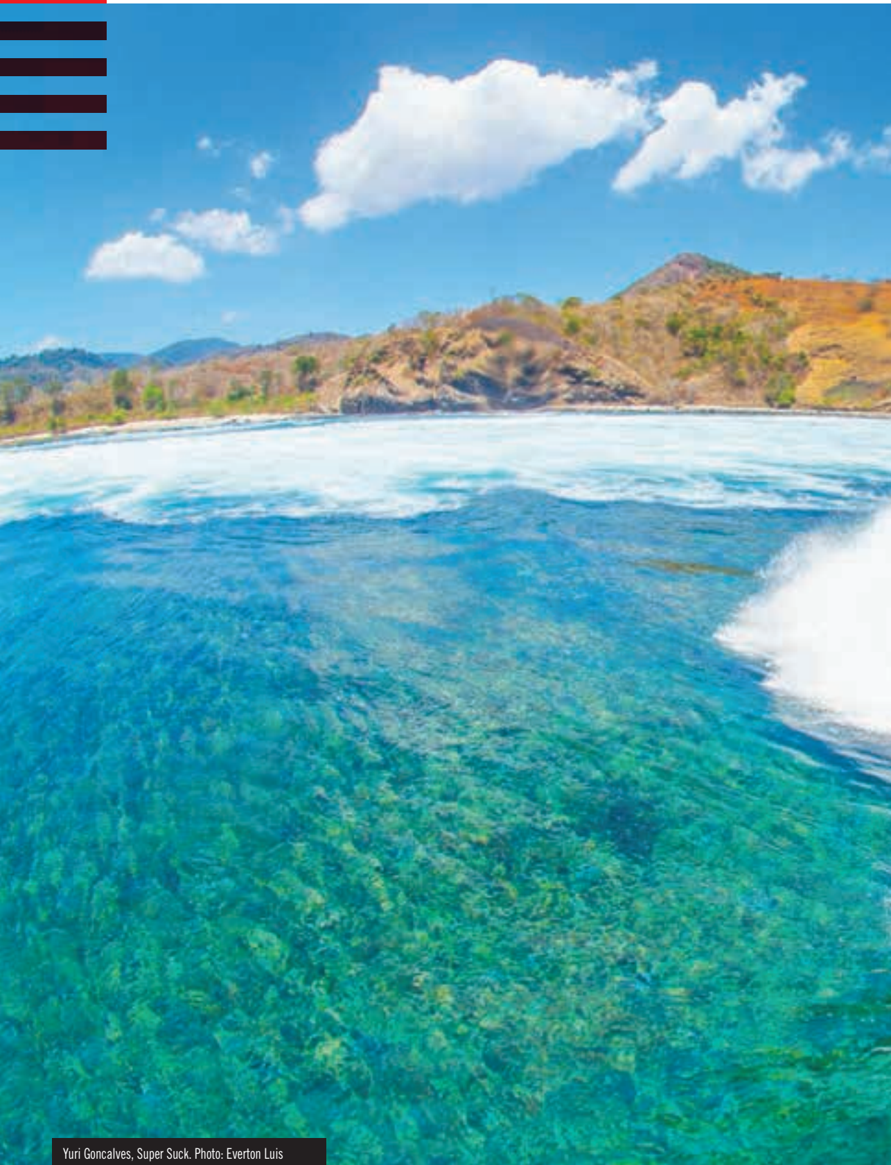
Yuri Goncalves, Super Suck.