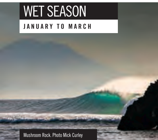
Mushroom Rock.