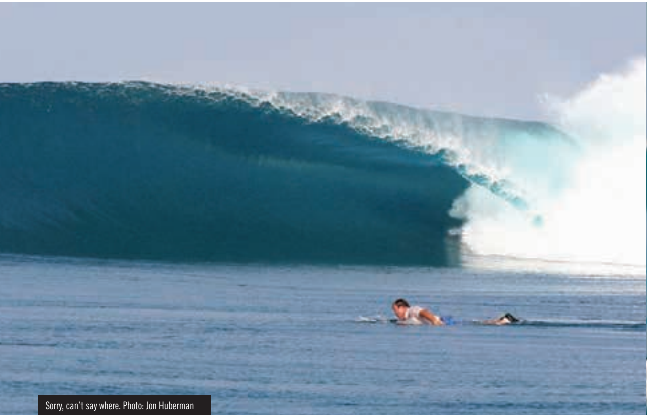
Sorry, can't say where.