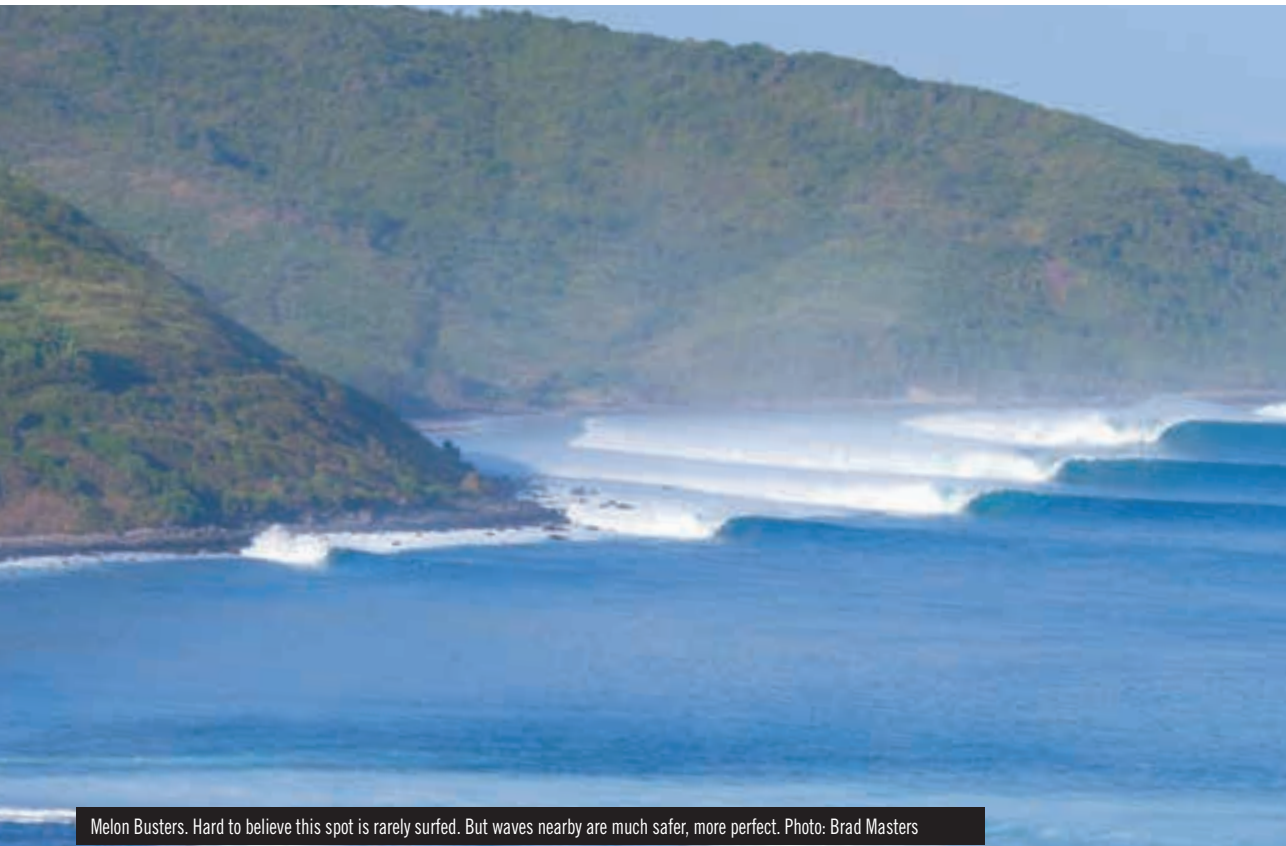
Melon Busters. Hard to believe this spot is rarely surfed. But waves nearby are much safer, more perfect.