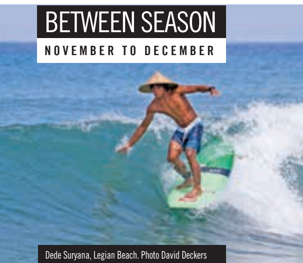
Dede Suryana, Legian Beach.