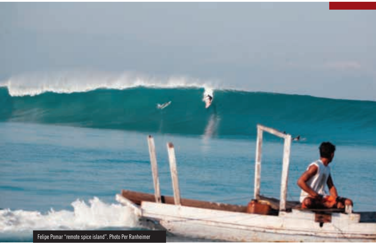
Felipe Pomar "remote spice island".